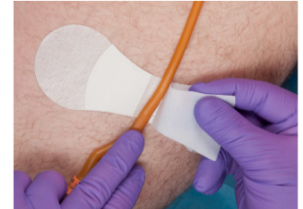
3400L for large universal securement