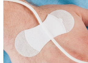
3300M for medium universal securement