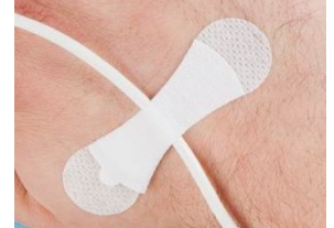
3200S for small universal securement