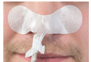
3401LNG for large tubing securement