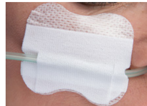
2100ANG for tubing securement