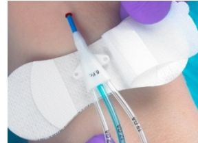
3300MWA for PICC & CVC securement