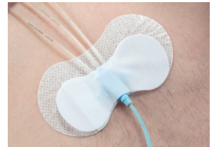
3601CVC for CVC securement